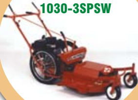
Model 1026-3SPSW 1030-3SPSW

26" or 30" Cut, Powerful 11.5 HP Briggs, Side Discharge, 20" HD-Spoke Wheels, HD-Tires w/ Sealed HD Precision Ball Bearing, Dual Front Swivel Wheels, Plow Style Handles, Quick Height Adjustment, Self-propelled, 3 Speed Peerless Transmission, All Sealed Ball Bearings.